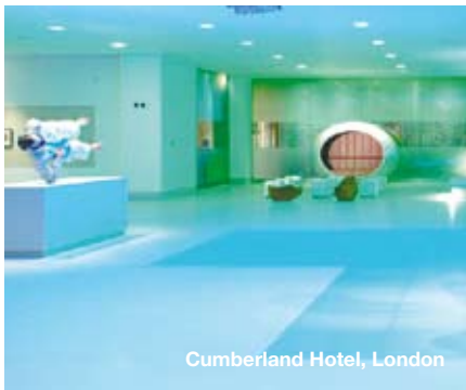
Cumberland Hotel, London