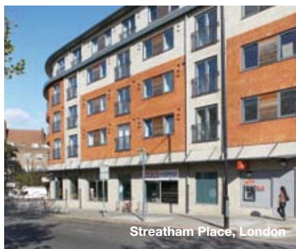
Streatham Place, London