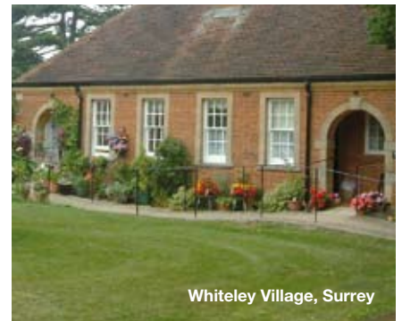
Whiteley Village, Surrey